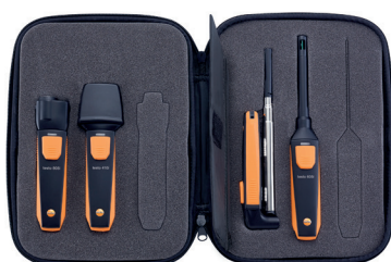
VAC Smart Probe Kit: 0563 0003