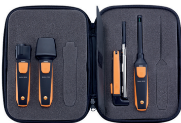
VAC Smart Probe Kit: 0563 0003