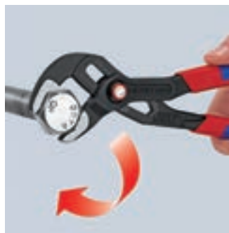
Hinge bolt locks itself with the first workload