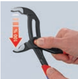
Press the button – open pliers completely

The KNIPEX Cobra® QuickSet combines all proven properties of the KNIPEX Cobra® with an additional push on function which makes it easier to work in very confined and inaccessible areas. Adjustment directly on the workpiece is possible by simply sliding the pliers handle. The hinge bolt locks itself with the first workload. The gripping width of the pliers is then fixed and can only be adjusted by pressing the button. The hinge bolt must be released by pressing the button and the pliers must be completely opened once to activate the QuickSet function again.