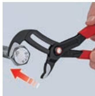
Position jaw – simply slide and close pliers