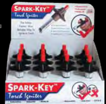
580512* : 12 pack