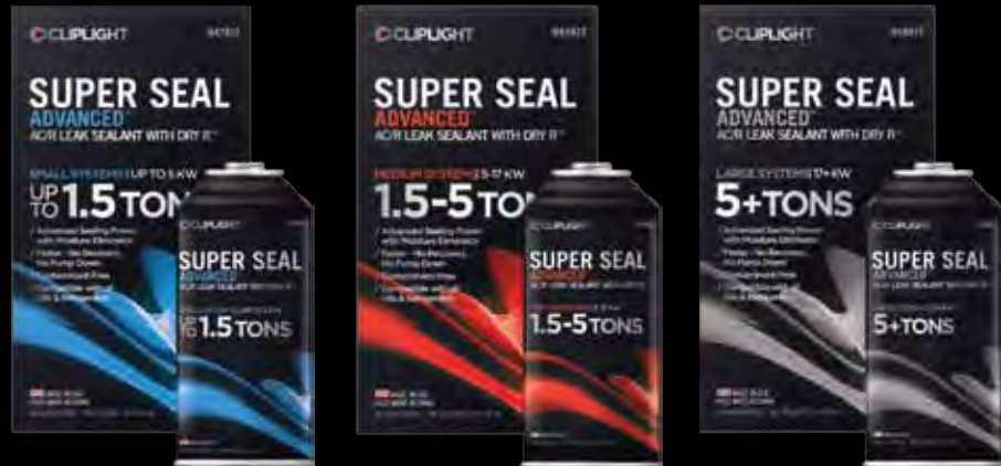
947KIT* SMALL SYSTEMS UP TO 1.5 TONS | 5 KW

SUPER SEAL ADVANCED™ is engineered to HVACR industry standards and is easily installed into a fully-charged system, with NO pump down or recovery. Recommended for systems that are not losing more than 15% of the entire charge over a four-week period.