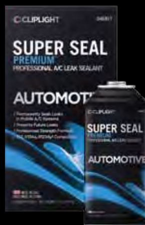
946KIT* ALL AUTOMOTIVE SYSTEMS

20125*: R134a to R12 conversion valve sold separately