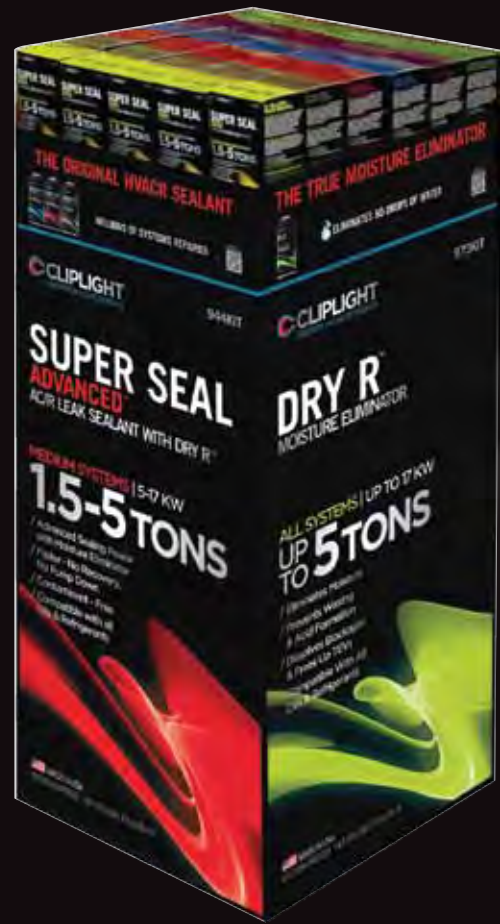
30 PACK FLOOR DISPLAY