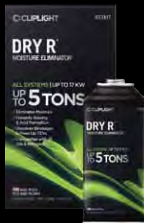
973KIT* ALL SYSTEMS – UP TO 5 TONS | 17KW APPLY SECOND CAN FOR SYSTEMS 5+ TONS | 17+ KW

conditions and stabilizes oil by lowering overall moisture parts per million – no particulate, gels, or polymers will form. Ideal for reducing the harmful effects of moisture in all oils and refrigerants, it is essential for removing moisture in 410a systems.