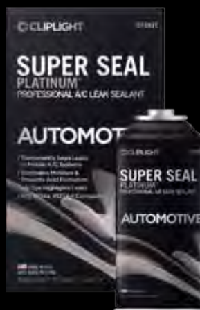
976KIT* ALL AUTOMOTIVE SYSTEMS

20125*: R134a to R12 conversion valve sold separately