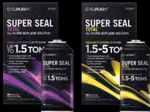
971KIT* SMALL SYSTEMS UP TO 1.5 TONS | 5 KW

SUPER SEAL TOTAL™ is engineered to HVACR industry standards and is easily installed into a fully-charged system, with NO pump down or recovery. Recommended for systems that are not losing more than 15% of the entire charge over a four-week period.