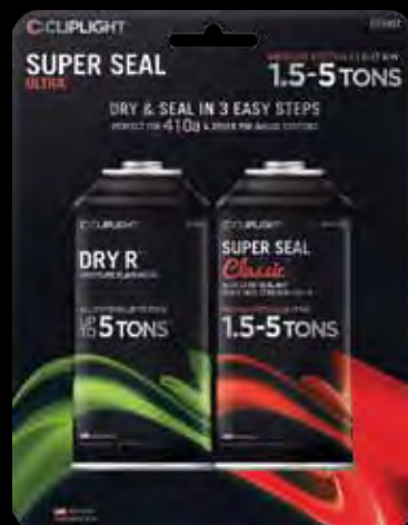
979KIT* MEDIUM SYSTEMS – 1.5-5 TONS | 5-17KW

is engineered to HVACR industry standards and is easily installed into a fully-charged system, with NO pump down or recovery. Recommended for systems that are not losing more than 15% of the entire charge over a four-week period.