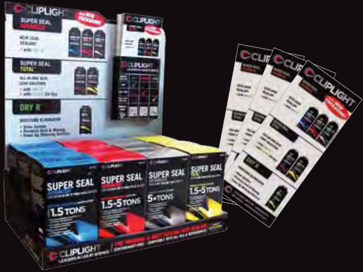
12 PACK COUNTER DISPLAY WITH PRODUCT BROCHURE